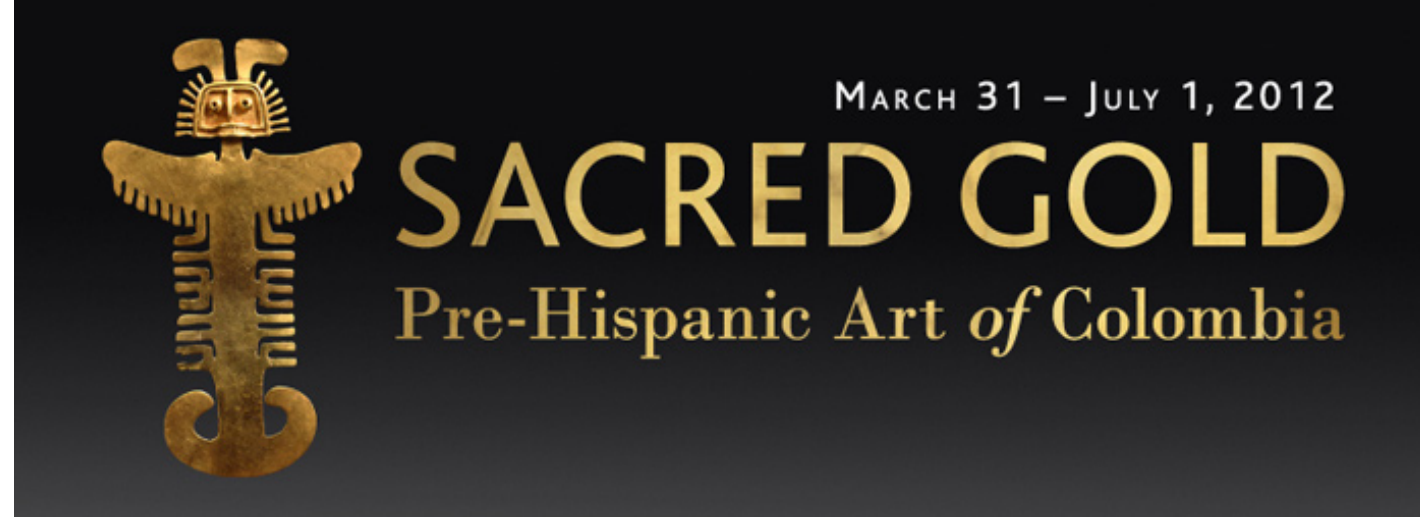
Bowers Museum is open Tuesday through Sunday 10 a.m. - 4 p.m. General admission is $12.

For more information about "Sacred Gold: Pre-Hispanic Art of Columbia" or any other upcoming exhibits, visit www.bowers.org.