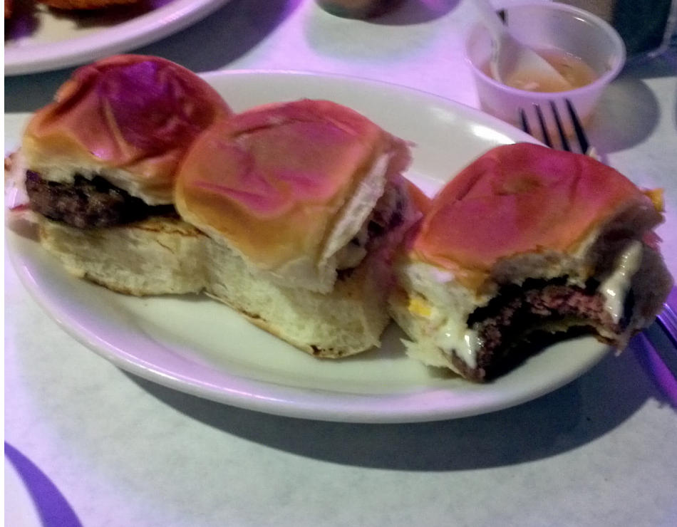
The King of all sliders entree.

The only downside to Rooster PM is that the serving sizes are a bit small, but that's not really what the place is about. Any shmuck can go stuff his face at Hometown Buffet for two and a half hours. Rooster PM is a fun, trendy place to go hang out and probably try something new at the same time. Located on Randolph St. in Costa Mesa (the street is only 200 yards long and it's the only building with lights at night), Rooster PM is a cool place for any type of social outing, you should go check